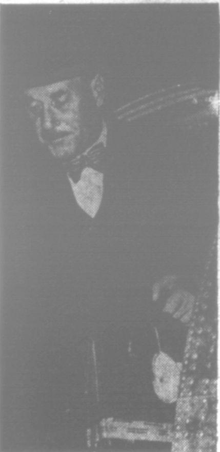
Maurice Hechschild, fabulously wealthy Bolivian mine owner, is pictured as he arrived via Clipper at Miami, Fla. His strange disappearance early in August for 17 days has never been explained. He was a political trouble.

amended declarations; all persons who owe the final installment of 1944 estimated tax.