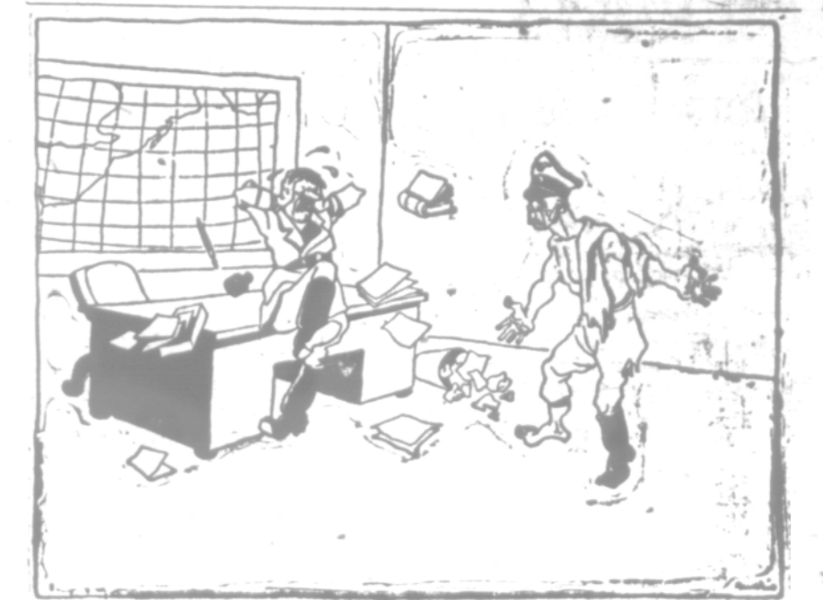
"DON'T TELL ME, ANOTHER VICTORIOUS RETREAT!"

my boy friend here lately. He is that makes me hopping mad, it nopes me, and if there's anything ignorance."