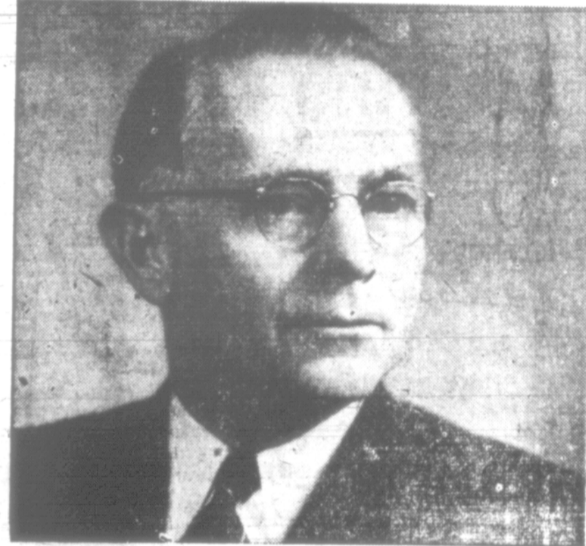
United States Senator Guy Cordon Has Done His Work Well