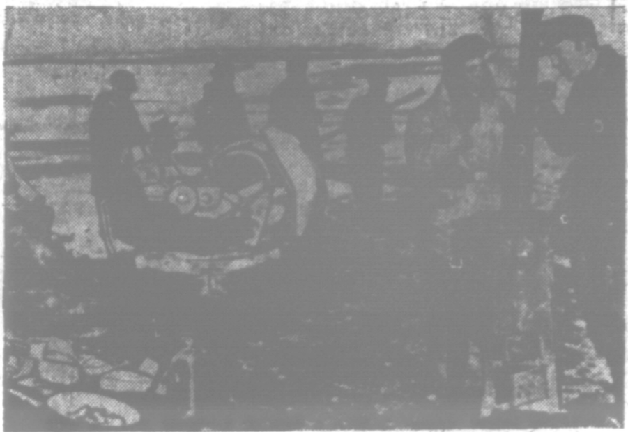
This picture, received through a neutral source, shows members of a German anti-aircraft gun crew snatching a few moments from Russian air attack to grab a bite to eat, somewhere on the Russian front. The food which they seem to be eating with great relish, apparently was prepared on a portable stove.

Weather has been generally cool for the past week although Wednesday and Thursday were warmer. A high wind blew Monday to change the air around Sherman county wheat fields. Wheat in the north end of the county is pretty well made and any damage that happened to it will have to come soon. Farther south there is still danger of hot weather damage, the extent of which depends on the weather man.