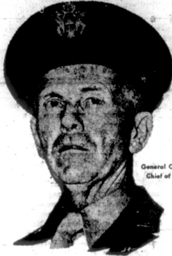
General George C. Marshall Chief of Staff, U. S. Army