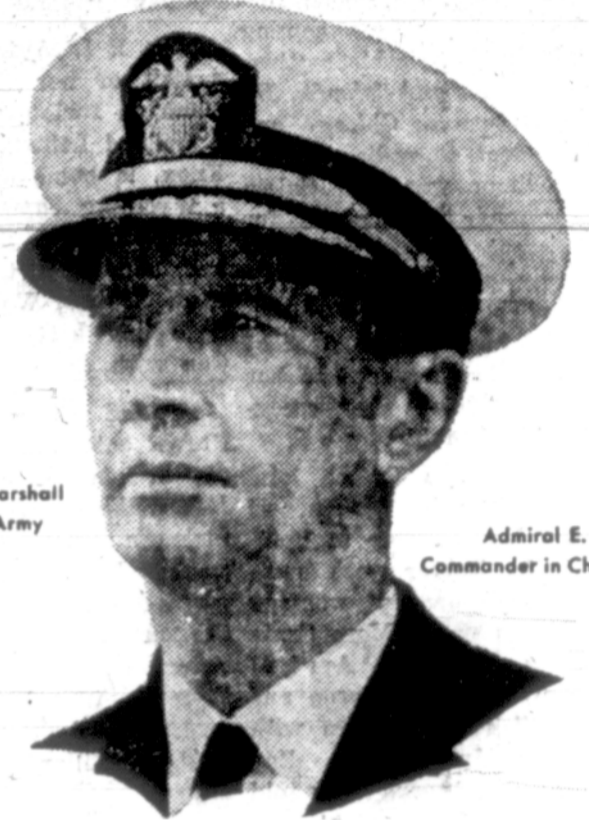
Admiral E. J. King Commander in Chief, U. S. Fleet