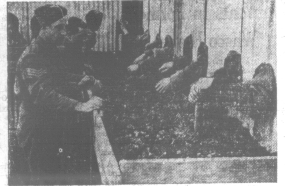
Now that the enemy are using more mines and booby traps than ever before, a school has been opened in Britain where units other than Royal Engineers can take a four-day course on our own and enemy mines and booby traps. Picture shows instructors watching students at work behind the Meascar Stocks, a device constructed so they can handle various types of mines and booby traps in the dark.