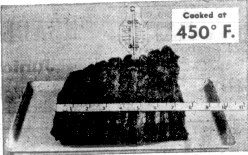
3 lbs. 4 oz. Lost in Cooking at High Temperature