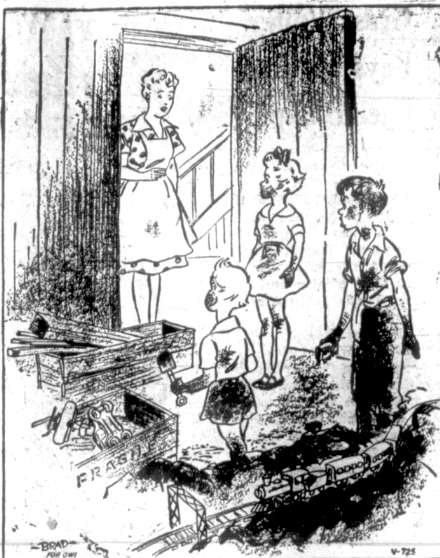
YOU'LL SIMPLY HAVE TO FIND ANOTHER PLAYHOUSE, CHILDREN. WE ARE GOING TO GET THE COAL BIN FILLED TOMORROW.

There'll be more shoes for civilians, too. WPB has permitted a 25 percent increase in output of shoes for boys, misses and children and infants as well as greater production of men's work shoes. WPB is also following tests made by the National Bureau of Standards on two sole treatment oil compounds designed to lengthen wearing quality of shoes.