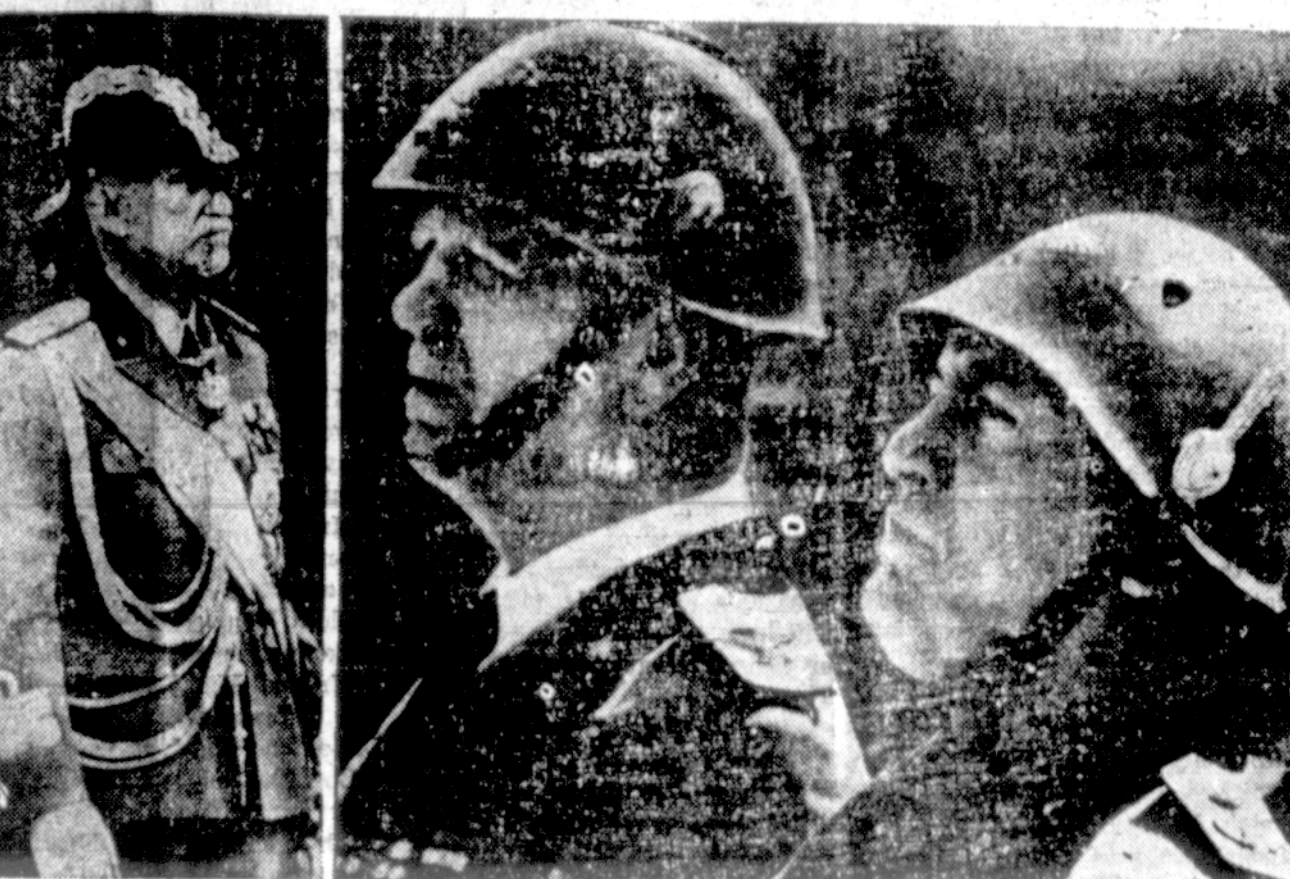
The sudden political demise of Benito Mussolini makes him the first Axis dictator to fall under the military and intellectual might of the Allied nations. Left: King Victor Emmanuel III of Italy who accepted Mussolini's resignation and appointed Marshal Pietro Badoglio, center, as the new premier of Italy. Although Badoglio announced that "the war continues," as he proclaimed martial law, he has never been a member of the official high ranking Italian fascist group which surrounded Mussolini. He has been known to have disagreed with the former premier several times. Right: Benito Mussolini who took advantage of the unrest of World War I to create a dictatorship and now finds himself overthrown by similar forces in World War II.