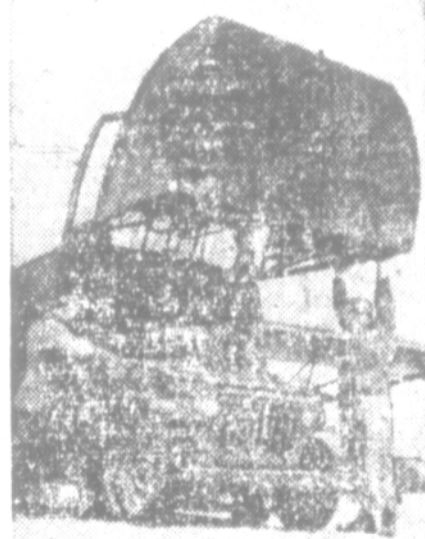
A jeep is shown being loaded into one of the huge gliders being built for the army. The noses of the gliders are hinged. They are towed to the destination of their cargo by bomber planes.