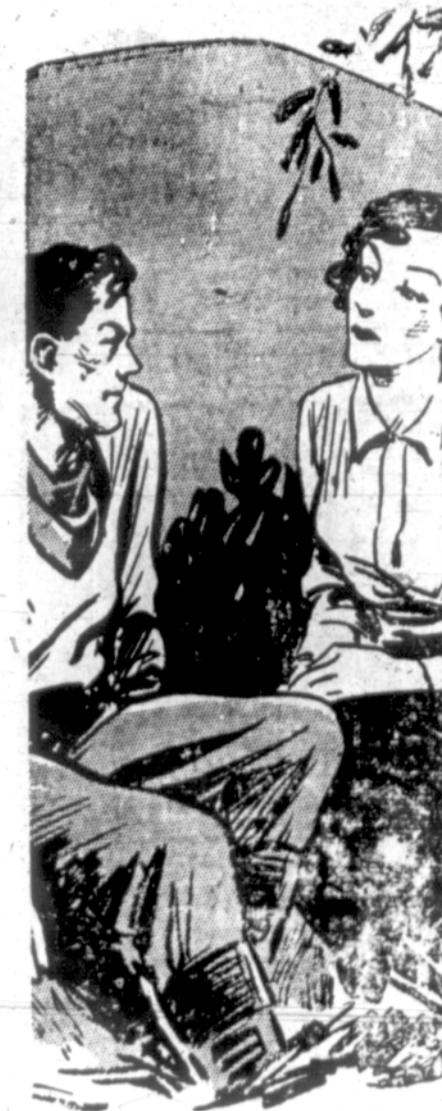
"Herendeen has sent over the mountain for the Ryder boys."

"What?" "Go back to old times. We'd do the same things, and make the same mistakes. Nothing changes." She turned her head to him, her lips pressed in soft humor. But the expression on Morgan's face sent the smile away and for this short heady interval of time they were remembering the same things, hard-touched by them, dangerously stirred by them. That old closeness came back, that old reckless, sweet wildness came back and shook them; and for a moment he was shocked alive by the things her nearness did to him. The past rushed up and he saw her as he