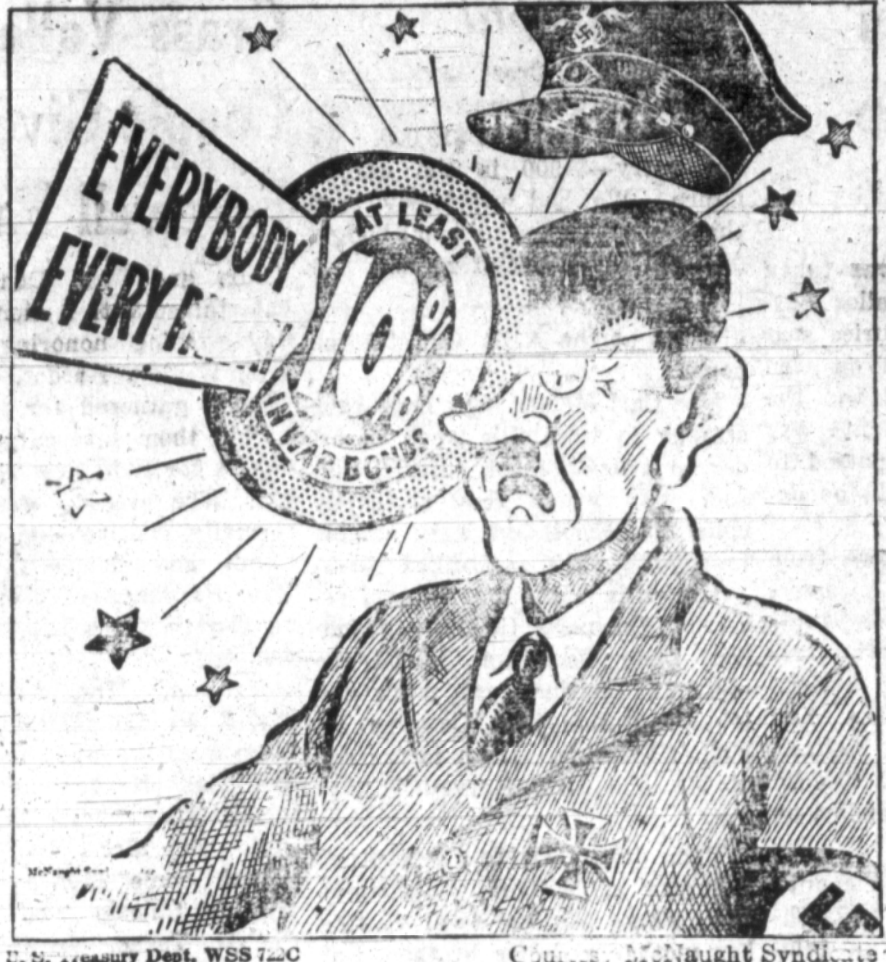
U. S. Treasury Dept. WSS 7-20

HI-WAYS TO HEALTH by ADA R. MAYNE OREGON DAIRY COUNCIL