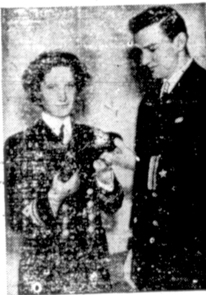
Lieut. Franklin D. Roosevelt Jr., son of the President, chats with an officer of the women's royal naval service after his arrival in London.