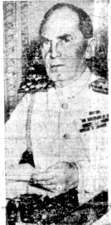
Bear Adm. William D. Leahy, pictured at his desk at the state department in Washington, as he assumed his duties as President Roosevelt's chief of staff. Leahy, in his new capacity, is responsible only to the President.