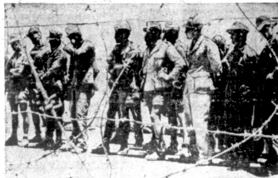
These German soldiers penetrated much deeper into Egypt than they had planned and are shown on the wrong side of a barbed wire cage for prisoners of war at Cairo. They are some of the men with which General Rommel made his push across the desert to El Alamein, where he was stopped by British forces.