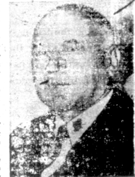
Ingram Stainback, 56, who has been a United States attorney in Hawaii, has been nominated as governor of the territory by President Roosevelt. Stainback was born in Tennessee.