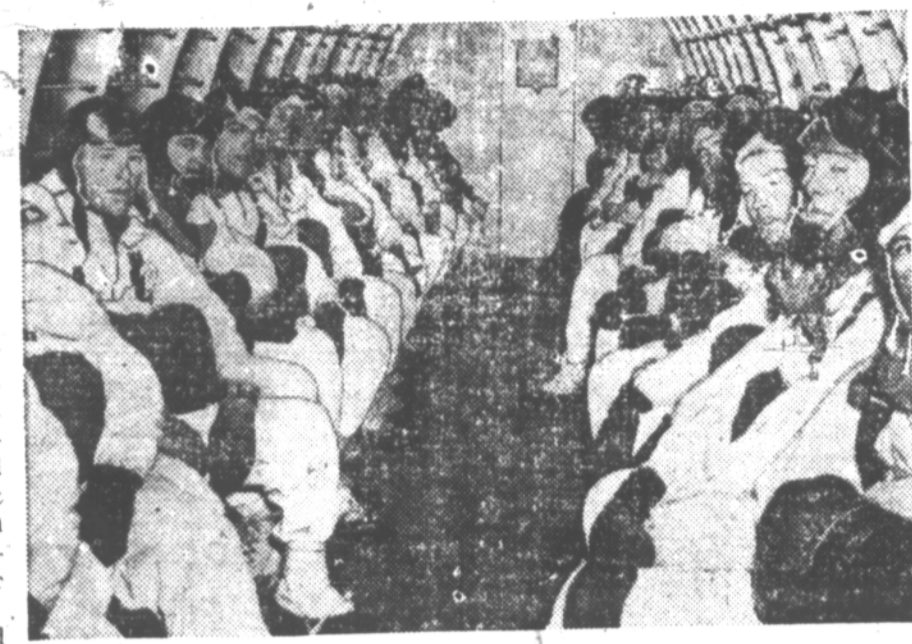
After a hard training grind, ski troopers of the 503rd parachute battalion are now seasoned paraski soldiers. A group of the jumping snowbirds are pictured inside their transport plane en route to their jump- off place near Alta, Utah. Their skis and other equipment will be dropped to them by large parachutes after they have leaped.