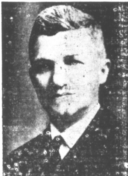
Admiral Thomas C. Hart, 64, who commands the U. S. Asiatic fleet.