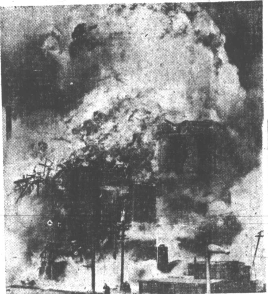
This spectacular picture was taken just as a billow of white hot flame blew off the top of a United States Grain elevator, in Chicago, during a $300,000 fire, of mysterious origin. More than 350,000 bushels of corn were destroyed. Furnace-like heat melted steel girders like butter and drove back firemen.