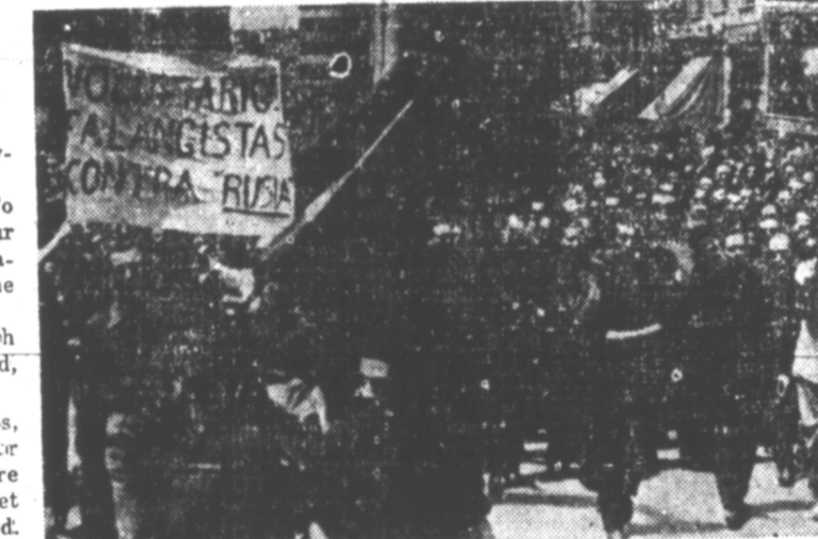
With banners and bands, enthusiasm is whipped up in Spain for crusade against the Reds—this was part of the Nazi campaign for a Spanish legion to fight against Russia on the eastern front. A drive which ended in "fiasco," according to London. Spaniards, says London, have had war enough.