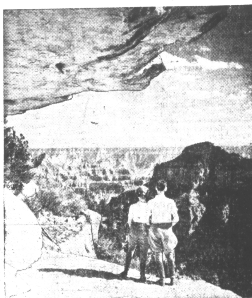
The Grand Canyon is always described as the world's greatest spectacle by the thousands who visit it each year. There is nothing in the world which approaches it in form, size and color. From Bright Angel Point on the north rim, the canyon is thirteen miles across and has an average depth of a mile. Grand Canyon was made a national park in 1919.