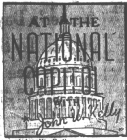
Continued from page one.

Other changes are in the offing. Unless inside reports are incorrect, the boys of the national guard, now in federal service for a year, will not be released after their hitch. Draftees will not be sent back to civil life and instead of selecting older men (26 to 35) the army wants younger men, those