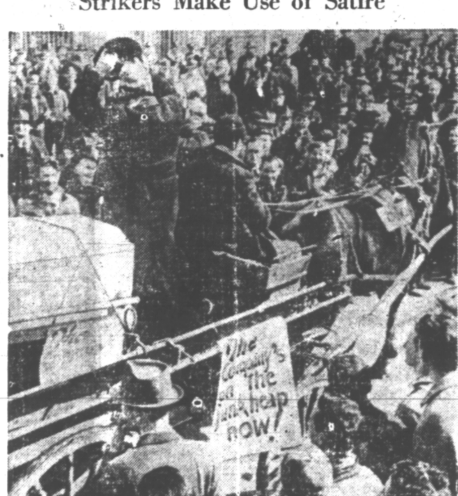
The coffin represents the Allis-Chalmers company. It is perched on a junk wagon, and a striker, wearing a gas mask, gives a satirical address showing the connection.