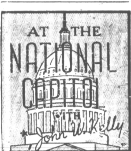
AT THE NATIONAL CAPITOL

Oregon motorists will begin feel- ing the effects of new legislation a most at once. Secretary of State F. M. Snell has warned that some 40,000 operators' licenses will be expiring within the next few months. When these are renewed motorists will find that the cost has been increased 50 per cent. The legislators tacked on an ex- tra 50 cents—25 cents a year— to create a fund to reimburse hos- pitals for the care of indigent victims of traffic accidents.