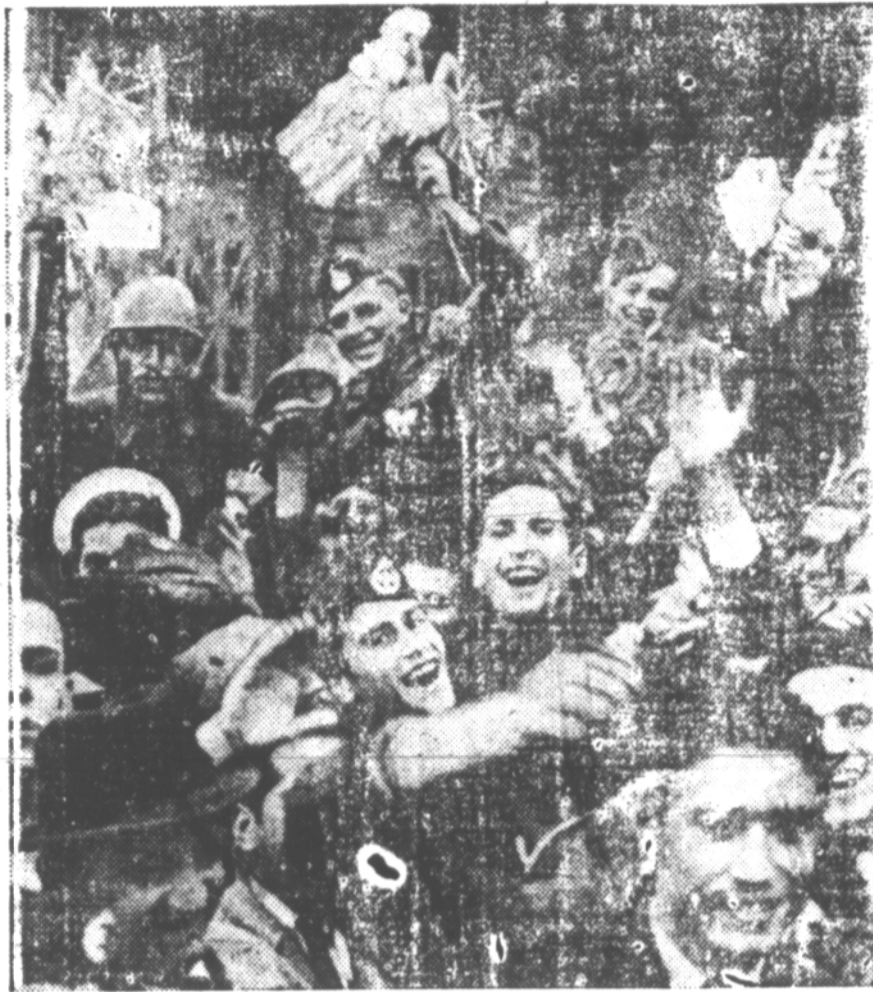
Wild with joy over their country's successes against the Italians, the populace of Athens, Greece, gives a rousing reception to Greek and British soldiers home from the battlefield. The British fighters have Greek and Greek flags. The Greeks are grateful to the British for the aid they have given them in Albania, where the Duce is still in reverse.