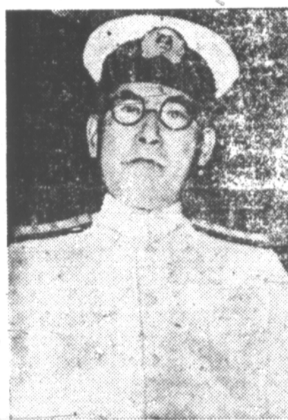
Vice Admiral Kichisaburo Nomura, who has been appointed to the important post of Japanese ambas- sador to the U. S., succeeding Gen- suke Horiuchi.