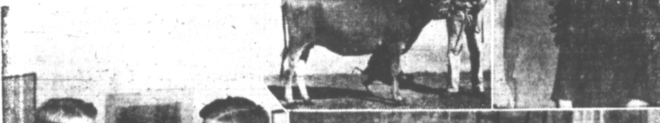
Top: Prize livestock from 4-H barns goes on auction block at fair. Right: Future Farmers have livestock exhibits, too. Below: The L. L. Patterson cup, much coveted, goes to the outstanding 4-H'er at the fair.