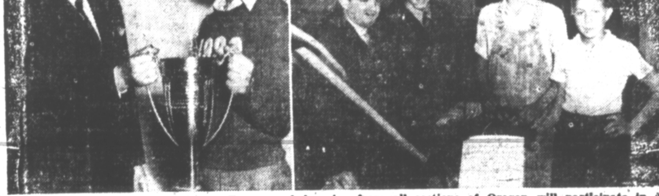
4-H boys and girls and Future Farmers of America from all sections of Oregon will participate in the 79th Oregon state fair at Salem, beginning Labor day and lasting through Sunday, September 8. The fair brings to them a week of keen competition in contests and demonstrations as well as exhibits.