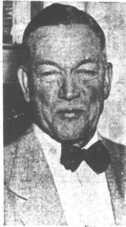
Sen. Charles L. McNary of Oregon, Wendell L. Willkie's running mate on the Republican ticket. The candidate for the vice presidency has been a senate leader for a number of years and a strong advocate of farm relief. He is said to have been Willkie's own choice for second place and is expected to be a strong running mate.