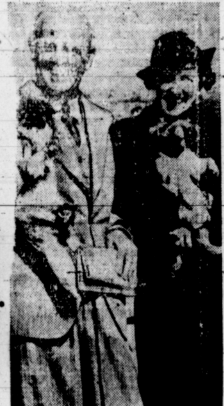
P. G. Wodehouse, British humorist, and his wife (shown) were giving a cocktail party in Le Touquet, French channel coast town, when the Germans came along. He was interned, but his wife was allowed to leave.