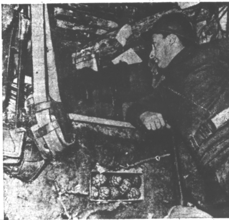
Somewhere on France's Lorraine front a French soldier keeps eternal vigilance behind his rifle-machine gun, lest a German surprise attack be successful. Note the cache of hand grenades just below the gun. They are used for close-in fighting.