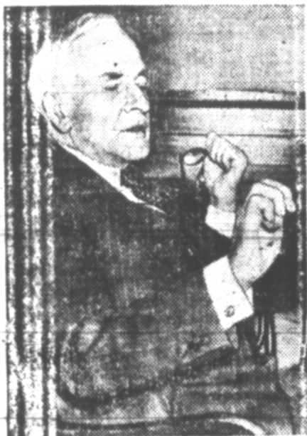
A continuation of "liberal" American trade policies begun in 1931 was urged by Secretary of State Cordell Hull as he appeared before the senate finance committee in Washington recently.