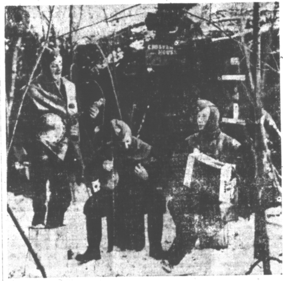
The "Grosvenor House Orchestra," a musical trio recruited from Britain's royal air force, conducts a "jam-session" somewhere in France on the western front. "Grosvenor House" is also the name of their dugout, as well as the name of an exclusive London hotel. The enemy's savage breast was not reported soothed by the music.