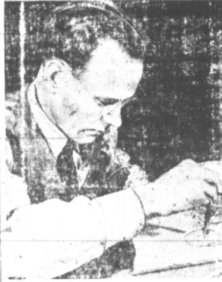
Pictured at work in the office of his Fort Wayne, Ind., laboratory is Philo T. Farnsworth, who was recently designated one of the "ten outstanding young men of 1939." Farnsworth, who is now 21, had filed a patent application on a complete television system before he was 21.