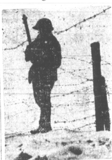
A Swiss army sentinel is shown at his barbed wire surrounded post near the German border. Since the outbreak of European war the army of Switzerland has been fully mobilized and at its defense post.