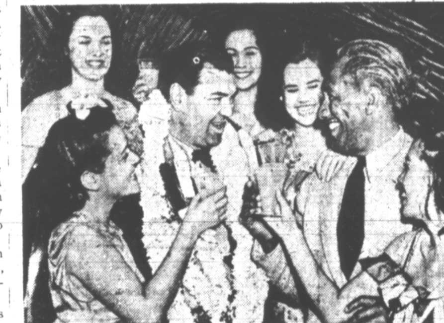
A royal Hawaiian welcome is given Jack Dempsey by Duke P. Kahanamoku, famous swimmer and official greeter, and a bevy of island belles as the former heavyweight champion disembarks at Honolulu. The beverage, incidentally, is pineapple juice.