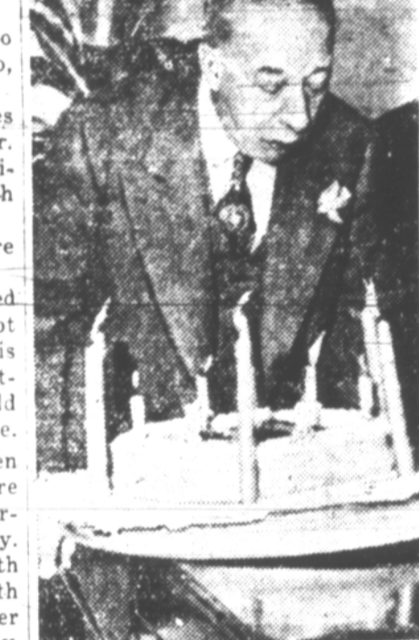
Alfred E. Smith, former governor of New York and one-time presidential candidate, celebrates his sixty-sixth birthday with a "blackout." He extinguished six big candles a decade each—and six small ones at a party in the Empire State building in New York city.