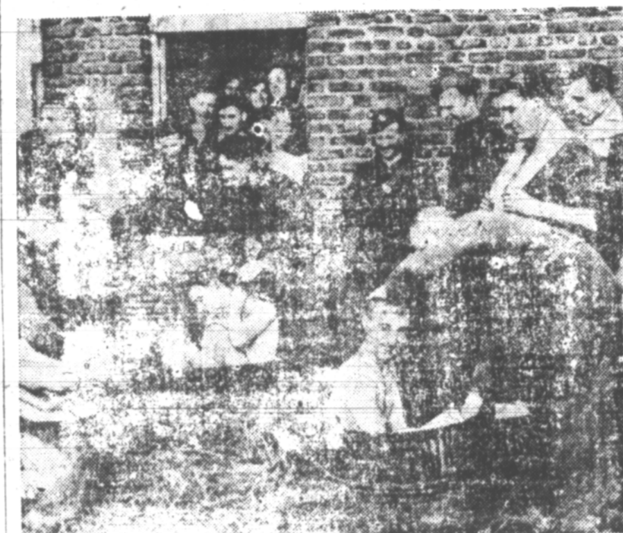
War is war, but Saturday night has a tradition. So these British troops take time out for their Saturday night bath. No de luxe accommodations for "Tommy Atkins" today, but wooden tubs and tin palms make a satisfactory substitute for behind-the-line ablutions.