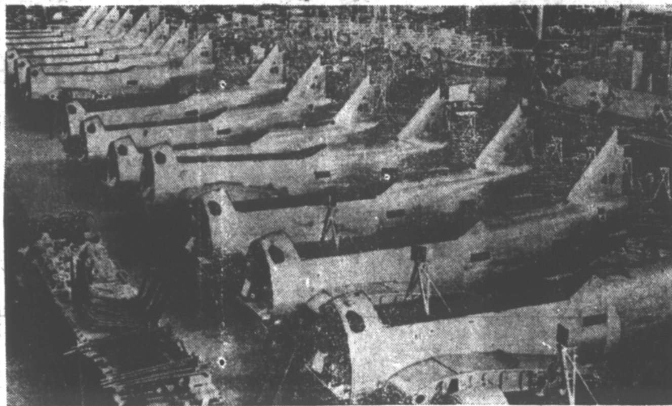
The announcement by President Roosevelt recently of the completion of plans for the training of 20,000 college students annually as civilian pilots, with a consequent increase in the nation's air force, has proved exciting to aircraft manufacturers. Above is a view inside the North American Aviation, Inc., plant near Inglewood, Calif. The basic combat and 0-47 observation assembly lines are seen, with 0-47 wings visible in the foreground.