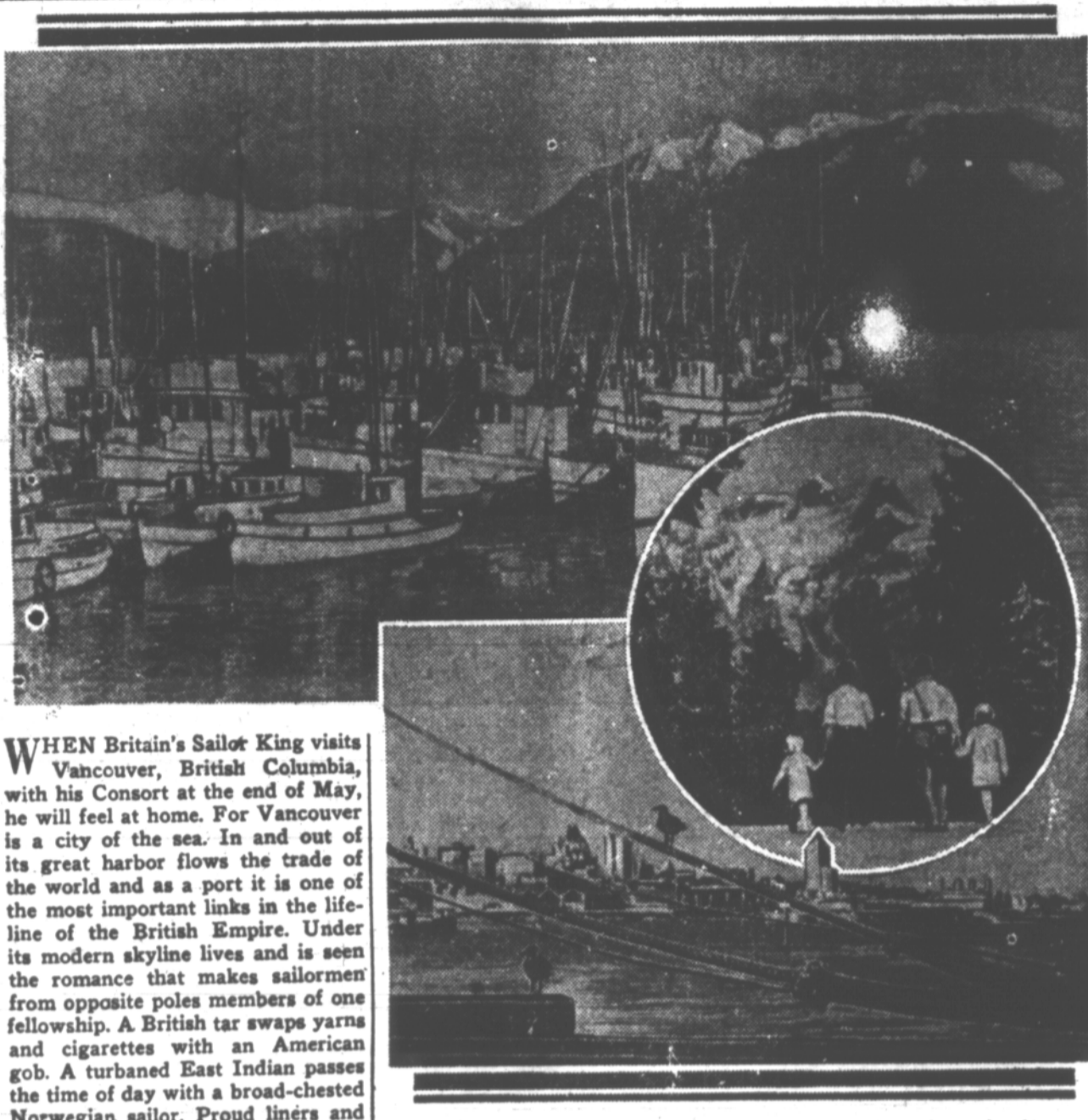
WHEN Britain's Sailor King visits Vancouver, British Columbia, with his Consort at the end of May, he will feel at home. For Vancouver is a city of the sea. In and out of its great harbor flows the trade of the world and as a port it is one of the most important links in the life-line of the British Empire. Under its modern skyline lives and is seen the romance that makes sailormen from opposite poles members of one fellowship. A British tar swaps yarns and cigarettes with an American gob. A turbaned East Indian passes the time of day with a broad-chested Norwegian sailor. Proud liners and nondescript tramps tie up side by side at the piers, and through Vancouver's pulsating harbor moves all the necessities of life. Pictured above are three typical views of Vancouver.