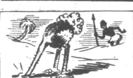
A SULLIBLE BIRD IS THE OSTRICH TALL, WHO THINKS HIS SAFE WHEN HE ISN'T AT ALL.