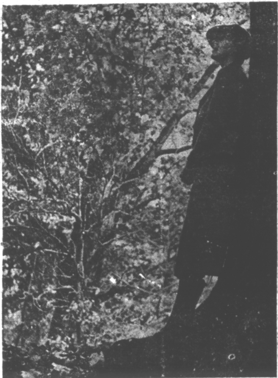
Autumn's official arrival September 23 has already been forecast in the northern woods where Jack Frost's paint brushes have tipped the leaves with brilliant browns, reds and yellows. While men of the northern hemisphere prepare for the winter to come, September 23 marks the arrival of spring in the southern hemisphere.