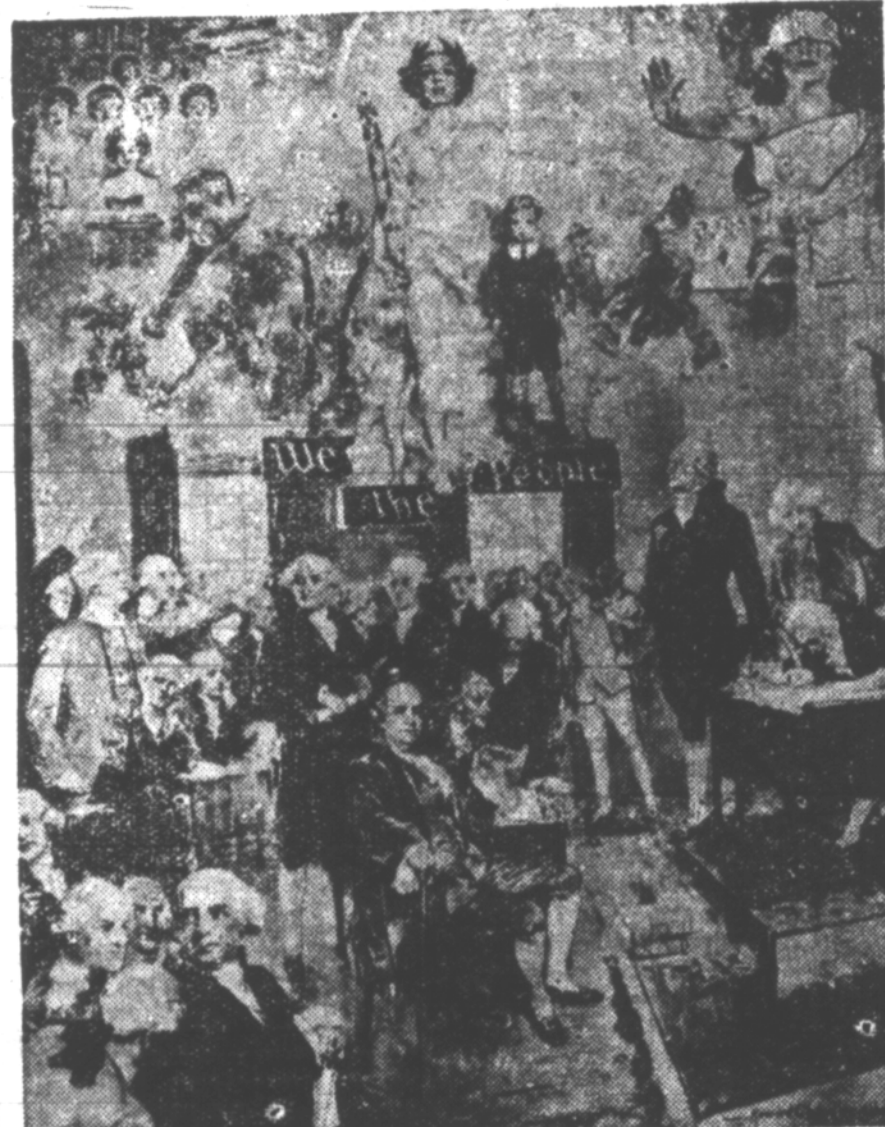
The nation pauses to observe Constitution day September 17, symbolized by Howard Chandler Christy's famous painting reproduced above. The painting shows George Washington addressing the Constitutional convention in Philadelphia, while at the top are figures symbolizing phases of the preamble to the Constitution and elements in the 151 years of progress under that document.

were visitors at the festival Saturday while visiting parents here.