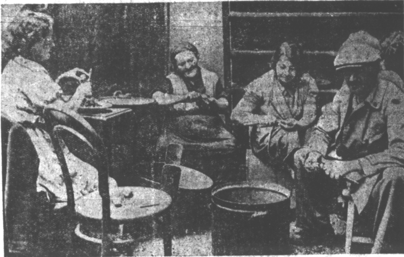
Poverty-stricken political refugees from Germany and Austria are finding a haven in Czechoslovakia. The government has established a camp for these unfortunate people at Brunn where they work together at various chores. This group is peeling potatoes.