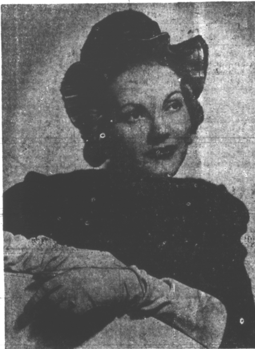
The growing seasonal attention to autumn and winter fashions makes this "little girl" design an attractive eye-fur. Black galyak fur is the big feature, while the Scotch plaid silk facing adds a flattering touch of color above a bandeau of the fur.