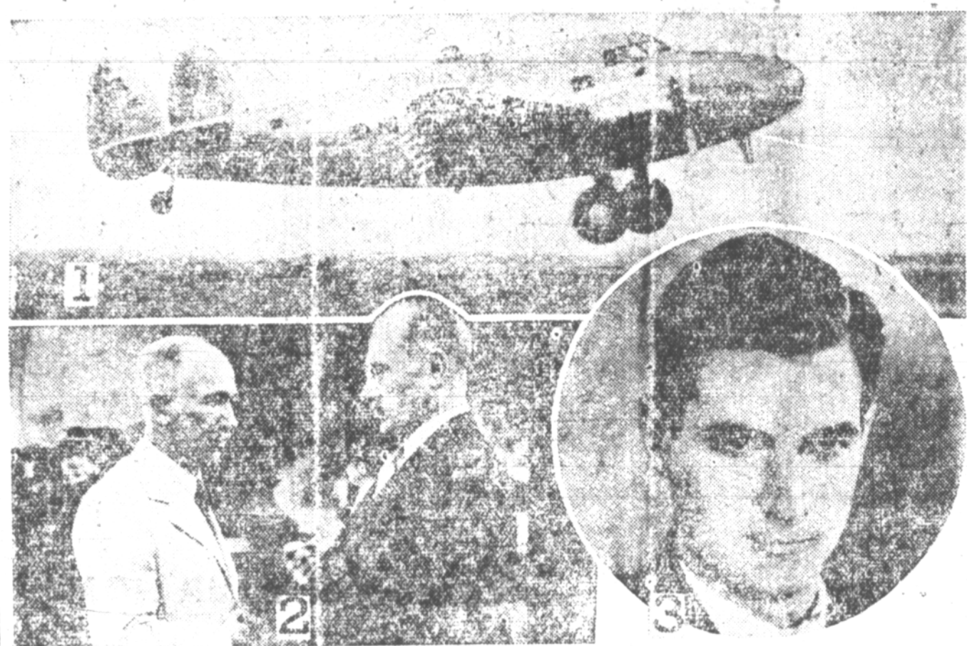
1—The big twin-engine monoplane in which Howard Hughes, millionaire pilot, made the fastest trip ever recorded around the world. Only 3 days, 19 hours and 7 minutes after he took off from New York with a crew of four Hughes returned to his starting place. 2—Dr. Eduard Benes, left, president of Czechoslovakia, talks over European conditions with Dr. Milan Hodza, prime minister. 3—Howard Hughes, sensational young aviator who headed record-breaking world flight.