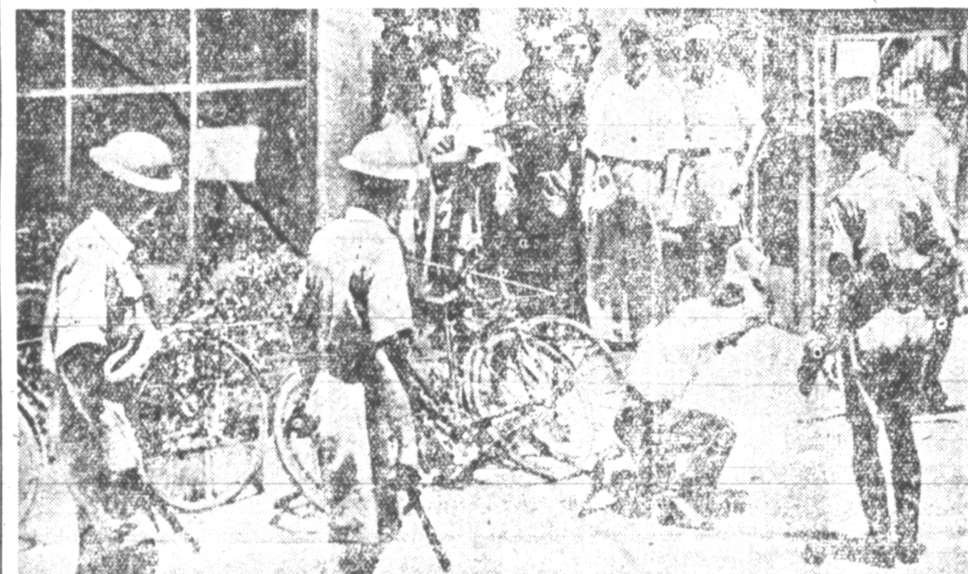
Watched by his companions, this demented man injured in a skirmish with the police at Tel Aviv, Palestine, holds his head as he attempts to rise. The demonstration which took place in the Jewish quarter near Haifa, followed the hanging of a Jewish youth who was sentenced to death by a military court for firing on an Arab bus.