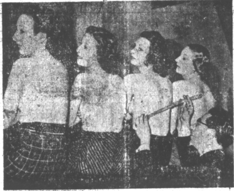
A back view of a Paris beauty contest, with one Frenchman wielding a rate in one of the easiest jobs on record. He's tallying the points of four girls competing for the title of "Prettiest Parisian of 1938" and faces alone aren't enough to convince him that a girl is beautiful.