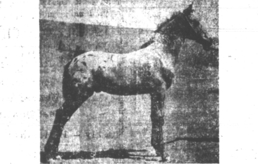
Painter III, Appaloosa Stud Colt of half Arab blood by Ferras 922.

Paintor III, Appaloosa Stud Colt of half Arab blood by Ferras 922.