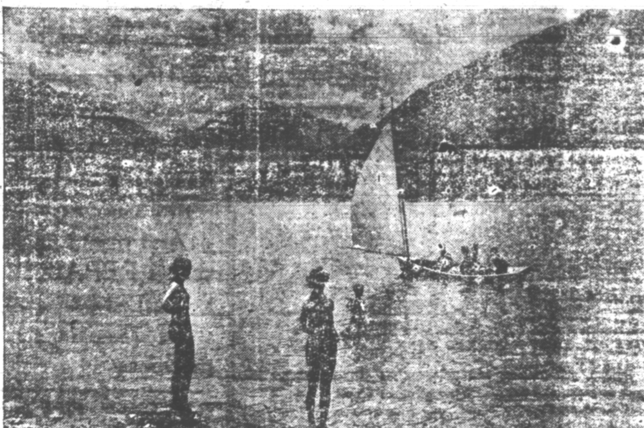
These scenes are from the La Grande and Wallowa lake region where thousands of vacationists head each summer. The Oregon Newspaper Publishers association chose La Grande for its golden jubilee convention, to be held June 17 to 19. The editors along with other folk who love Oregon's outdoors are looking forward to enjoying the attractions of the Wallowa lake country which is not really far away and accessible to the world over excellent highways. The top picture was snapped on Wallowa lake. The highway shown is the Old Oregon Trail—U.S. 30—between Pendleton and La Grande where the modern paved route parallels the oxcart tracks faintly visible in the foreground. At right—a horseback party climbing up into the majestic primitive area of the Wallowa mountains.