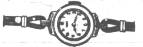
Elgin semi-baquette. Gold filled case. Raised figure dial. Black silk cord $29.75