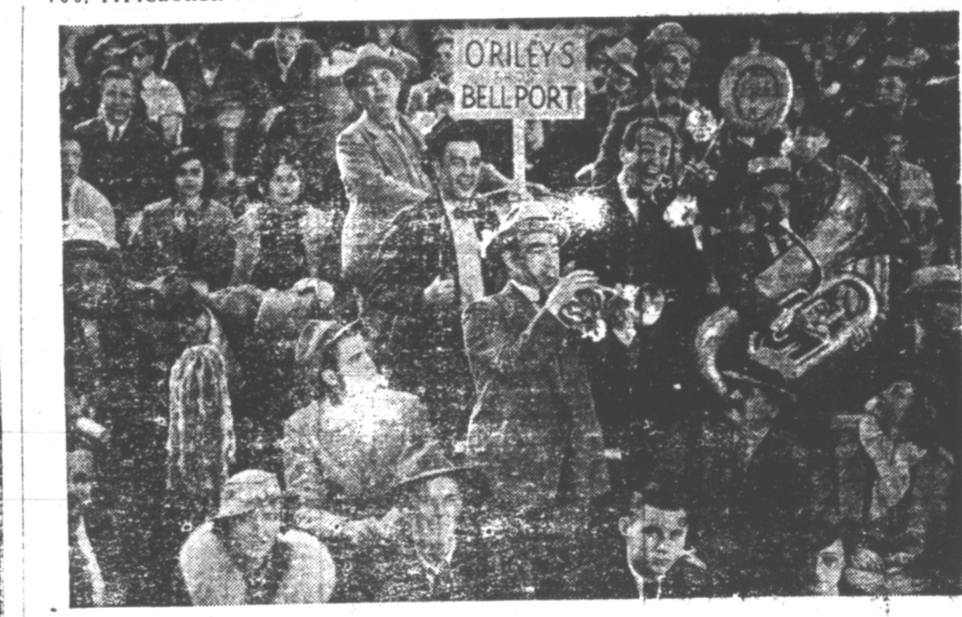
The horn-toting delegation from Bellport went wild as Paddy came sidwheeling through the opposing Pitt players.

SYNOPSIS Ozzie Merrill, All-American full-back at Sierra and Paddy O'Riley, second string quarterback at Green Ridge, a small eastern college return to Bellport, their home town, in the summer preceding their senior years at school. Both were rivals for the affections of Cheers Reynolds, Bellport belle, but Ozzie's ardor has cooled now that he meets her to do with Cheers because of her fascination for Merrill. Despite Merrill's disparaging remarks about the "hick" football team at Green Ridge, the outfit starts its season with a bang by bounding over some of the best teams in the East.