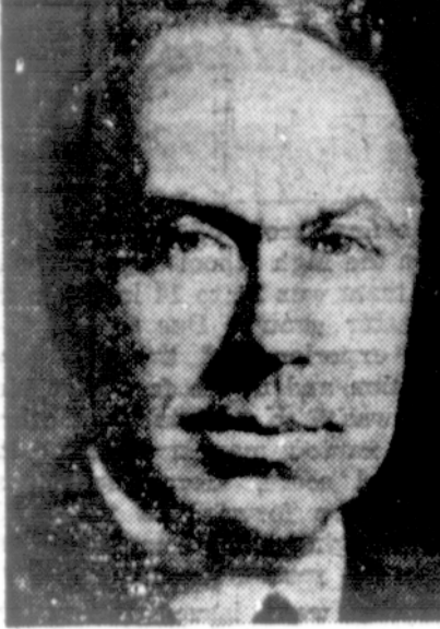
Raymond D. Fosdick, brother of Rev. Harry Emerson Fosdick, pastor of the Riverside church, in New York, who has been elected president of the Rockefeller foundation and of the general education board of that organization.