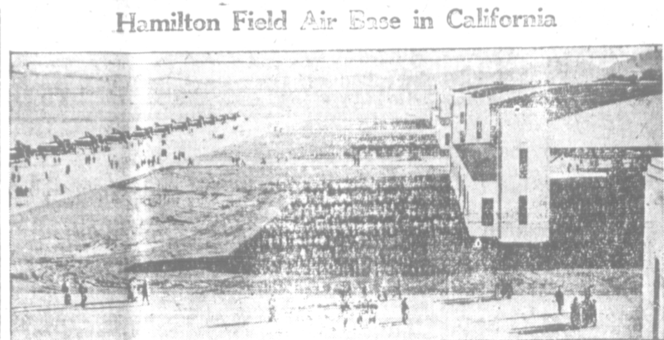
Under the reorganization plans of the army air corps the first wing is to be stationed on the Pacific with general headquarters at Hamilton field in Santa Clara County, Calif., a view of which is here given. The field is across the bay from San Francisco.

Every since the State Board of Health was created in 1903 to guard the health of the people of Oregon, the question of how much should be spent for health protection has, of course, come up every two years, when the Legislature meets. The present is, as all know too well, a time of especial difficulty in deciding to spend any money, what ever be the object. On the other hand, everybody knows that the United States, including the State of Oregon, is going to continue growing for an indefinite time in the future; certainly it will be long before our Nation, like others in history, turns into a decline, if it ever does so. Everybody knows that there are abundant resources of natural materials, labor, skill and machinery and capital to provide every individual in this country, including this state, a good living, and to satisfy the basic and reasonable desires of each man, woman and child. Perhaps such an ideal will never be attained. The ideal