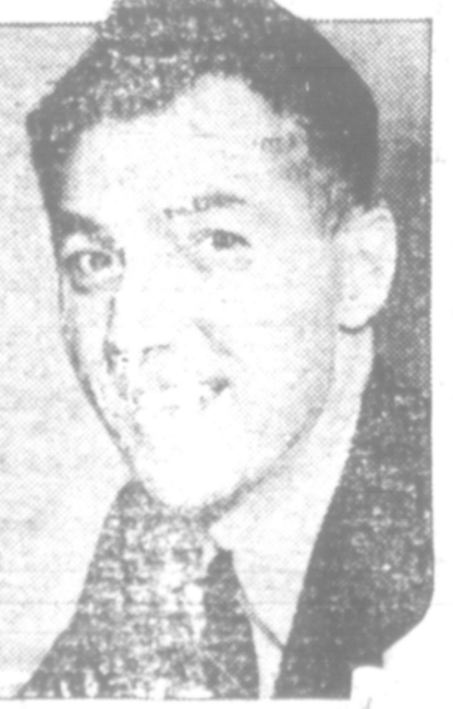
Ford Frick, former Denver and New York newspaper writer and more recently head of the publicity bureau of the National league, photographed at his desk in New York, following his unanimous election as the new president of the National Baseball league. He succeeds John Heydler, who resigned.

Trafalgar, Where Nelson Won Trafalgar, famous for the naval battle in which the British won, although Admiral Nelson was killed, is a cape to the south of Cadiz, capital of Spain.