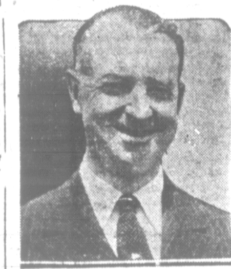
T. O. M. Sopwith, owner of the English yacht Endeavor, with which he will try to capture the famous America's cup off Newport in September.

Cranberries Need Acid Soil Cranberries thrive in an acid soil that most crops cannot use.