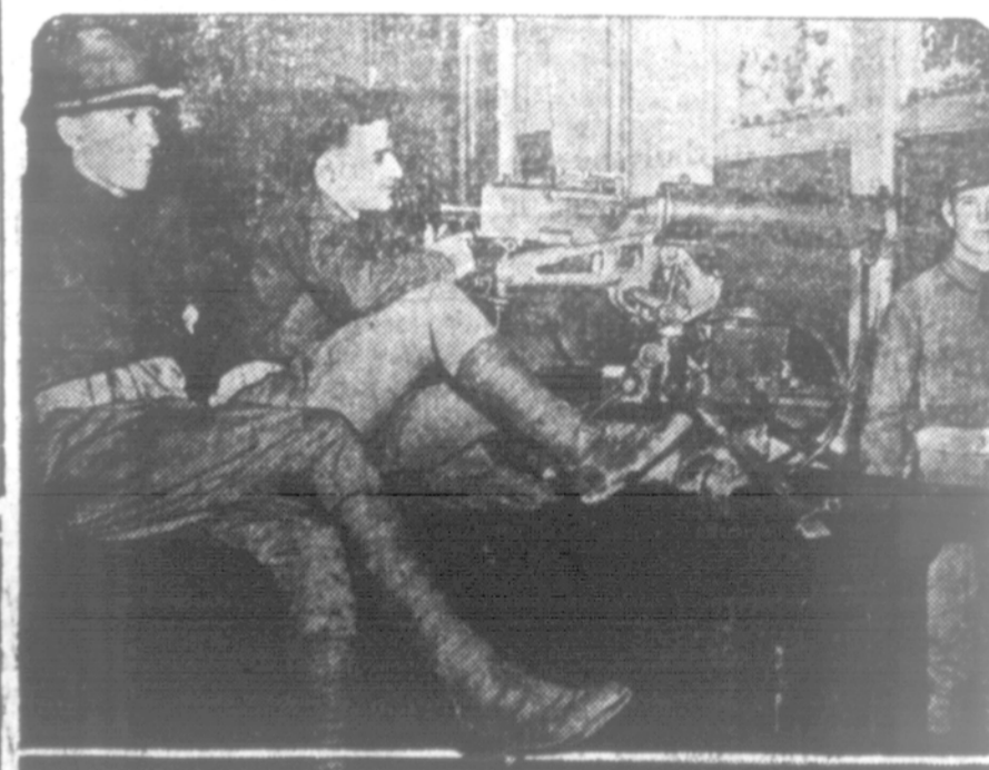
Scenes in the office of the registrar of voters in New Orleans, when a machine gun company of the state militia took over the job of guarding the registration rolls for Senator Huey P. Long. The gunners kept their weapons trained on the city hall, across the street, in case Mayor T. Semmes Walmsley should direct the police to stage a sortie.