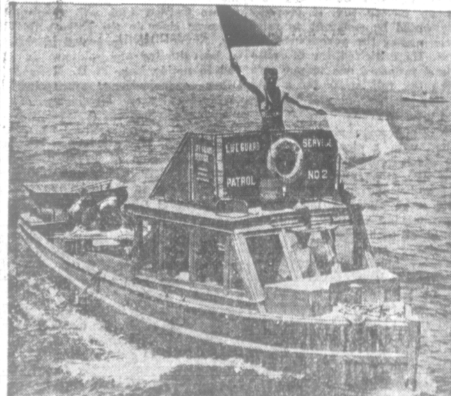
Built by the Los Angeles playground department for use by the life-guard service which protects its beaches, an unusual patrol boat has been put into service. Equipped with everything for lifesaving and resuscitation, from inhalators to stretchers and hospital equipment, the new boat is said to be the first of its kind. It is 33 feet long and has a speed of 15 knots.