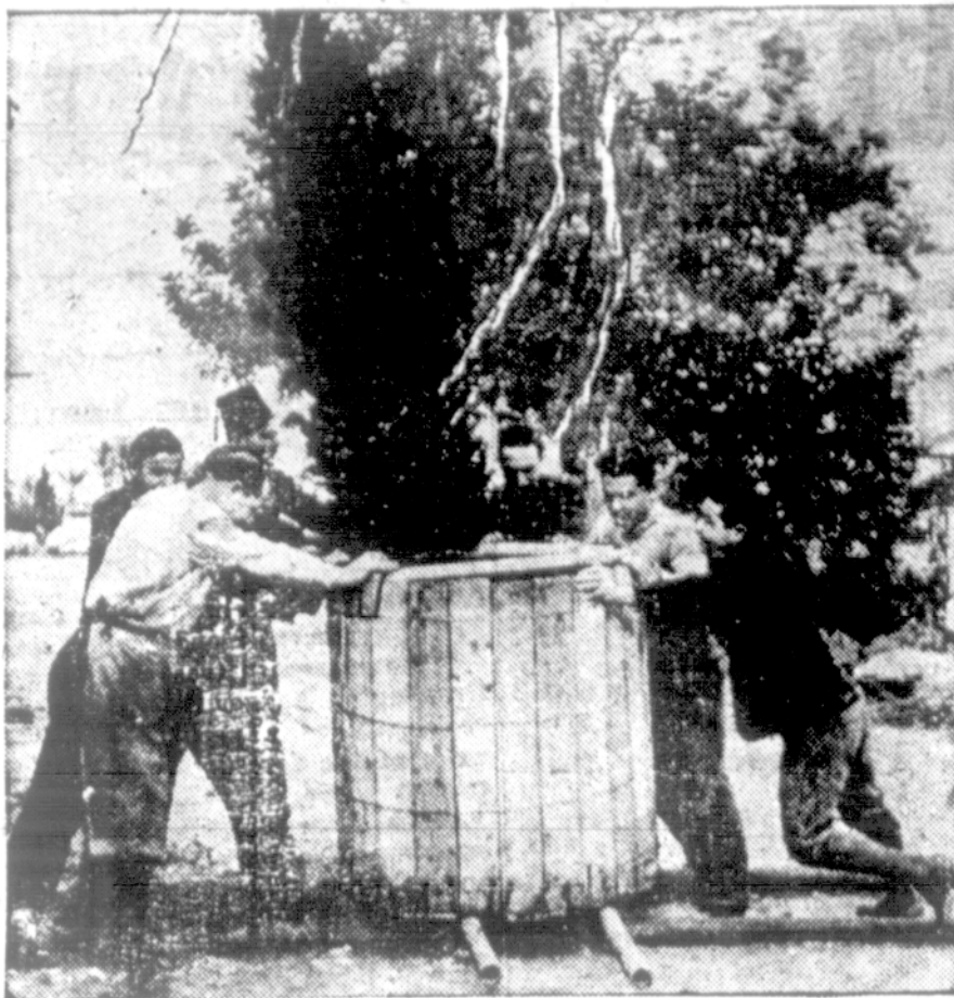
A young cedar, now ten feet high, from the grove from which Solomon selected wood for the temple in Jerusalem, starts on its journey to the White House lawn in Washington, where it will be planted.