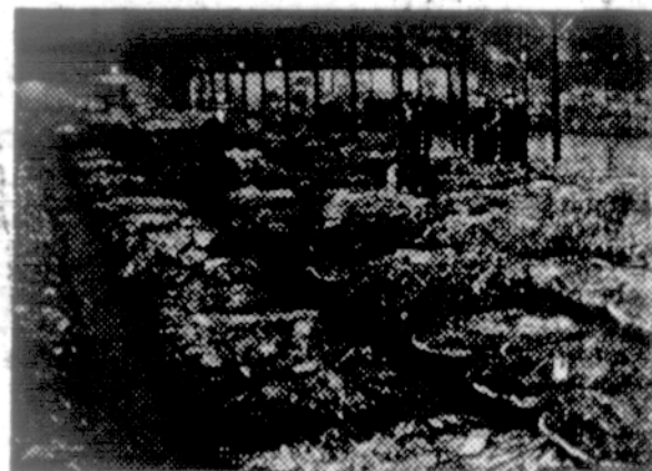
Auction today! Chesterfield buys the best.