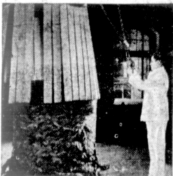
Chesterfield tobaccos are aged right